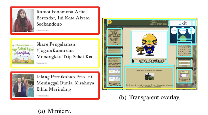
Figure 1: Examples of visual deceptive third-party contents.

Figure 1(a) shows an example of such a mimicry trick that we detect on the website https://www.bintang.com. The contents enclosed within the yellow rectangle were inserted by the third-party script https://securepubads.g.doubleclick.net/gpt/pubads_impl_207.js, whereas those in the red rectangles were the organic first-party contents. Without scrutiny, they just look like each other. The only visual hint for discriminating them is the text Sponsored , which was displayed in a very small font size just as the first-party sub captions in the red rectangles. Even though a user may notice this small text, she/he may still decide to click the third-party website which